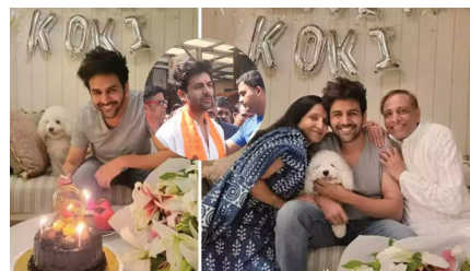
but I really ur maddest fan... And it's my dream to meet you in my life and I can do it." Another said, "Happy Birthday Kartik... here is to keep

Sanon whose comment bagged attention. She wrote, "Happiest Birthday Buntooooo. I have the best gift for you, stay tuned!" hinting at their upcoming project, Shehzada. Ayushmann Khurrana also wrote, "Happy birthday KA!" Rakul Preet Singh commented, "Happy birthday bdayyyyyy you star!! Have the most amazinggggggg year! May sky be the limit." Romit Roy also wrote, "Happy Birthday. I love you Koki." A fan wrote, "Happiness birthday to a one and only fav actor and my dream crush... Always be shine as you are shining... Stay blessed happy and healthy always... Love you loads... I know I don't get a reply from you.