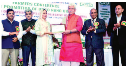
JJ NEWS SERVICE

J&K's economy is now growing quite strongly & Agri reform is the best cure for sustained growth: LG