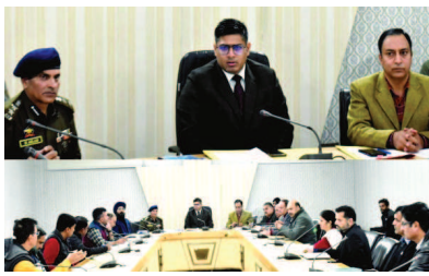
DC calls for maintaining close coordination among stakeholder departments