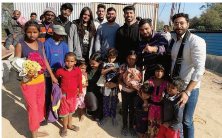
Social Responsibility Club of IIM Jammu.