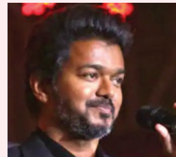
Both Varisu and Thunivu are releasing worldwide on January 12 next year. Directed

fact that Vijay sir is the number 1 star in Tamil Nadu. The state has a total of 800 screens. Right now, both the films are getting equal number of screens. I'm literally begging for at least 50 additional screens for my film because Vijay sir is a bigger star than Ajith." Fans took to the comment section to call out the needless remarks that'll unnecessarily instigate fan wars. One comment read: "Someone from another state creating fans fight between Vijay and Ajith. Please ignore this kind of talk going forward (sic)." Another comment read: "Why is he even comparing the stars? If Vijay is the bigger star, shouldn't his film automatically be given extra screens (sic)."