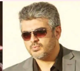
by Vamshi Paidipally and Rashmika Mandanna, Varisu co-starring will mark

Vijay's debut in Telugu industry as the movie has been simultaneously shot in Tamil and Telugu. Vijay's next project with director Lokesh Kanagaraj will go on the floors later this month. Thunivu , on the other hand, is gearing up for release amid very high expectations. The project marks the third consecutive collaboration between Ajith, director H. Vinod and producer Boney Kapoor. The film also stars Manju Warrier in a key role. Ajith is next teaming up with Vignesh Shivan for the first time. To be produced by Lyca Productions, the film will have music by Anirudh Ravichander. Nayanthara is expected to come on board as the co-star.