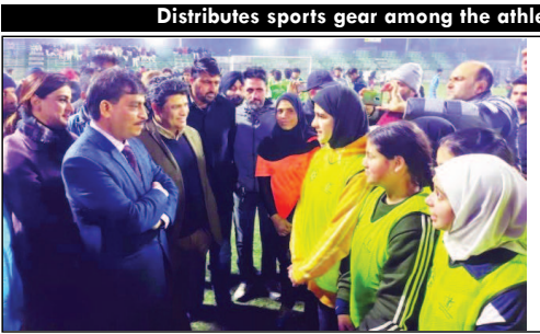
Distributes sports gear among the athletes