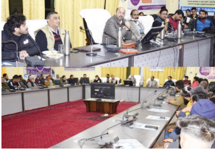
JJ NEWS SERVICE

Highlights job oriented government schemes