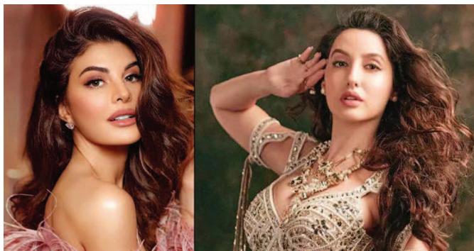
or print media against Nora or for that matter, any other person. She has consciously avoided talking