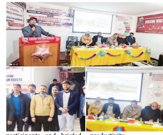
participants and briefed the audience about the scheme guidelines.