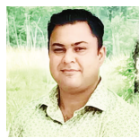
December he served as District General Secretary R S Pura District. After proving his efficiency he