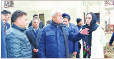
BARAMULLA/ BANDIPORA: Lieutenant Governor Manoj Sinha conducted on-site inspection and reviewed ongoing construction work of the transit accommodations for PM Package employees at Baramulla and Bandipora, today. The Lt Governor ascertained

the progress of the work being carried out at the two sites and laid emphasis on timely completion of all the works. He interacted with the officials, engineers engaged at Baramulla and Bandipora.