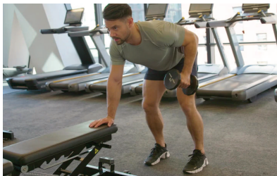
Moving heavy weight through a full range of motion is key for

THERE ARE TONS of different ways to train your triceps muscles (trust us, we've been known to highlight a few of our favorites), but not every exercise is created equal. While some movements might be an A on the grading scale, others might be barely scraping by to pass. Especially if you only have time for one big triceps move in your workout, you don't want to spend time on an exercise better suited for summer school than the Honor Roll. That's why we think the dumbbell triceps kickback is overrated.