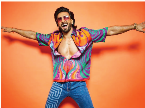
special dance number Current Laga in the film, did not accom- pany the star cast on the show. bana re hain, wo 10 minute ke Hum log 5 ghante ka show liye aajati (we are doing a five

Kapil also pointed out how Deepika Padukone, who has a