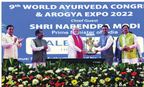
9th WORLD AYURVEDA CONGRESS & AROGYA EXPO 2022 Chief Guest SHRI NARENDRA MODI Prime Minister of India

Addressing the gathering, the Prime Minister welcomed all the delegates of the 9th World Ayurveda Congress from around the globe to the beautiful land of Goa and congratulated everyone for the successes of the World Ayurveda Congress. The Prime Minister highlighted that the World Ayurveda Congress is being organised when the journey of Azadi Ka Amrit Kaal is underway. The Prime Minister said that one of the key resolutions of the Amrit Kaal is to ensure global welfare through India's scientific, knowledge and cultural experience and Ayurveda is a strong and effective medium for that. Referring to India's G-20 Presidency, the Prime Minister informed about the theme of G-20 'One Earth, One Family, One Future'. The Prime Minister expressed happiness that more than 30 countries of the world have given recognition to Ayurveda as a