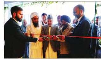
JAMMU: A showcase of tiles, Hardware, Kitchen Appliances and sanitary products under the name and style of "Aracot Construction" was opened today at NH-44, Sarore Adda, Bari Brahmana.