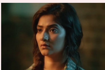
new home. "I understand how it feels when you come to a new city, have no family here and have to start from