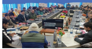
in a time bound manner. He said the funds earmarked for different components must be fully utilized. The Director asked the officers to take feedback from the farmers regarding the implementation of different CSSs. He exhorted the officers to work for the change of fortune of the farming community by adopting an innovative

approach in their work style. He highlighted the importance of minimizing the use of chemical fertilizers and asked the officers to increase awareness among the farmers regarding the soil health card scheme. He also instructed them to ensure that farmers apply for different fertilizers during the cultivation of various agriculture crops as per