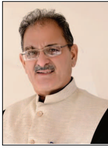
He said the decision to rechristen

In a statement issued on the international anti-corruption day, the BJP stalwart said that the impact of PM Modi's statement, 'Na Khayunga Na Khane Doonga' is widespread and in many places in the country corruption has become a thing of the past. He said that the scenario of anti-corruption operations in J&K is also very progressive as anti-graft agencies in Jammu and Kashmir traditionally were nothing more than toothless tigers as the erstwhile state always slotted top ranks in the cor-