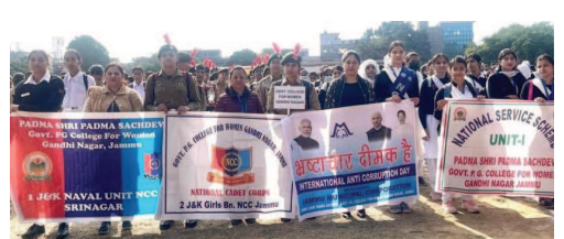
marched to Parade Ground to merge into the huge congregation. The participants were holding banners and Slogans to educate the public about the menace of Corruption and how to combat this malpractice. The massive Rally made its way towards its final destination via Old City, Bazar,

The Rally started from the College Campus and