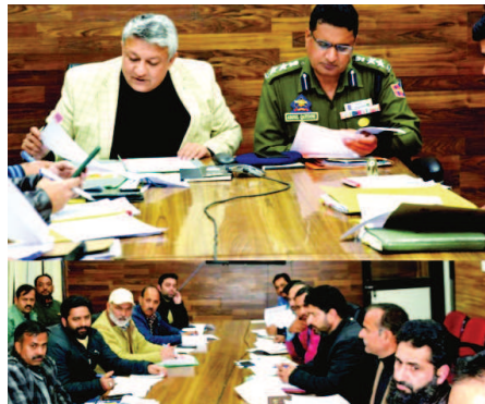
The meeting was attended by SSP Doda, CPO Doda, ACR Doda, CMO Doda, Dy Director Employment, CAO, DSWO, CEO Doda, CAO, AD FCS&CA, CAHO Doda, CDPO Bhagwah, representatives of Fire and Emergency, Legal Metrology, Army and PWD.