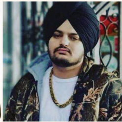
Talking about how Moosewala's security was pruned days before his murder, Diljit said, "100% ye sarkar ki nalayaki hai. Ye politics hai aur politics bahut gandi hai.

Bhagwan se hum prarthna kar sakte hain ki unko insaf mile aur aisi tragedy na ho (This is 100% government's failure. This is politics and politics is very bad. We pray to God that he gets justice and such tragedy never happens again).