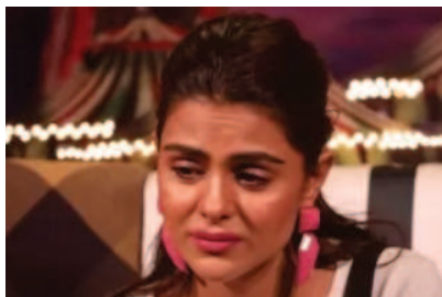
She was seen crying in the show. In a recent episode, Priyanka was seen breaking down after a huge fight with Ankit. She said she wanted to sort out things between them. It all started with Ankit's statement about Priyanka where he said that she does everything for the game only and this doesn't go well with her. She gets angry and both indulges in an ugly war of words.

Talking to Bigg Boss in a secluded room, she said: "I am a simple girl, who wants to get married but in Ankit's case, I am getting more emotional and somewhere proved wrong. And I am scared that people will start thinking that unnecessarily I keep arguing with others. Certain times, I feel so disgusted. I am worried whether I will get work or not."