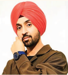
one child and he dies. His father and mother, how would they be living with it. You cannot imagine what they are going through, only they know it."

With concern for Moosewala's parents, Diljit said, "Think about it, you have just