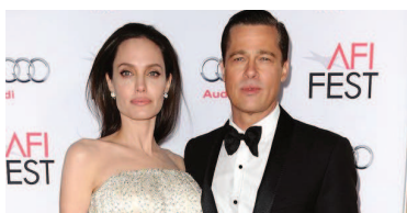
The Mirror' further states that Brad had previously claimed both he and his former wife made an agreement not to sell their parts of the property without one another approving it.

Angelina is also said to have claimed she didn't want to be in the alcohol industry when "alcoholic behaviour harmed our family so deeply". According to court documents obtained by RadarOnline.com, the 'Maleficent: Mistress of Evil' actress slammed Brad's "frivolous, malicious, and part of a problematic pattern" claims, with her own legal team providing an update.