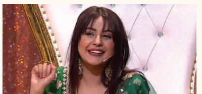
video. "Oh My God... You look so hot," a social media user commented. Another user wrote, "Uffiff yeh aadein." A third one commented, "Wow...can't wait for the song."

It's not just us, the fans think she is 'hotness overloaded' in the