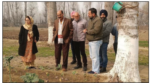
Director Agriculture Kashmir visits Gangbugh, Nunar farms. The group is seen in a field, engaged in a discussion about agricultural practices and seedling availability.