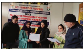
One-day Awareness camp on PM-FME held at NRLM (UMEED) center of Block Kangan. The image shows officials and farmers engaged in a discussion during the camp.