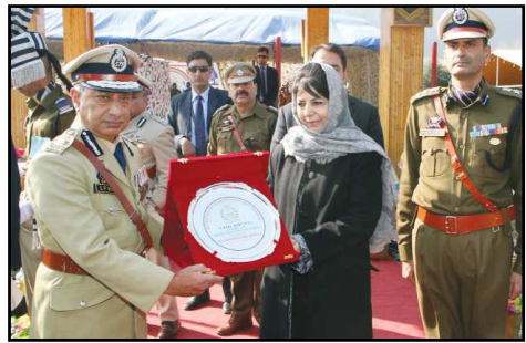
Jammu and Kashmir Chief Minister Mehbooba Mufti addressing newly recruits of Jammu and Kashmir Police during passing out parade at the Subsidiary Training Centre Sheeri on Sunday.

when they should be demanding good schools, hospitals and roads, the people of border areas in the State are asking for bunkers to protect their lives", she said while expressing her deep anguish over the loss of lives on the borders during the heavy shelling of past few days. Asserting that Jammu and Kashmir Police have the most difficult job in the country as they face many challenges," she said, "Your challenge is not just to maintain law and order or uphold the rule of law, but you have to face your own people, small children sometimes while maintaining law and order. At that time you will have to exercise maximum restraint." "Police should adopt community policing and a humane approach while dealing with day to day situations," she said, adding efforts should be made to ensure the return back of the local youth to their families and friends CONTD ON P-2