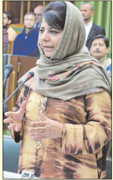
Terming dialogue as the core philosophy of her Government, the Chief Minister said she has been emphasising on this aspect for long and an interlocutor has been appointed. She hoped that all shades of opinion in the State would realise the emerging situation in Jammu & Kashmir and the heavy toll continued violence is taking.

Advocating opening of more routes along the LoC in the State, Mehbooba Mufti said recently a group of legislators met her and expressed the desire to visit Sharda Peth across the LoC. She said she was happy to see the media report recently that a Court there had directed proper upkeep of the said shrine. She said she has maintained it a number of times that Jammu & Kashmir is strategically placed and is rich in natural resources. "Why can't this feature be utilised to derive maximum benefits to the State and the country", she asked.