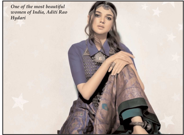
One of the most beautiful women of India, Aditi Rao Hydari

and even stalked her on some occasions. The police have registered a case under IPC sections 354 (D) (stalking), 509 (word, gesture or act intended to insult the modesty of a woman) and other relevant sections. The actress ruled the Hindi film industry during 70s and 80s era. Before venturing into films, she participated in the beauty pageant and was the second runner-up in the Miss India contest. She went on to win the Miss Asia Pacific in 1970. She featured in several blockbuster films and has worked with almost all the B-Town A-listers. Her impeccable acting prowess and immense contribution to Hindi cinema won her many fans across the country.